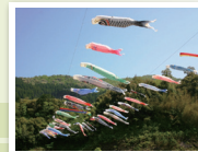
KOI NOBORI carp shaped wind socks along the ISUZU River