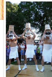
NAKAYAMA shrine festival