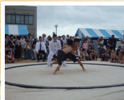
Kids SUMO wrestling