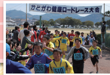
Beautiful view over KADOGAWA bay