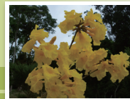
Brazilian flower IPE