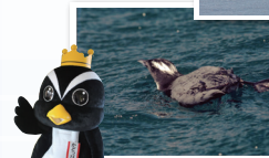
KANMURI UMISUZUME, a special natural treasure