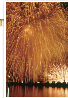
Fireworks from the sea