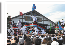
OZUE shrine festival