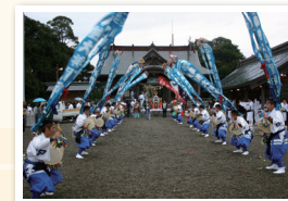
KADOGAWA shrine festival