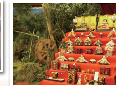
SANAGASE Japanese doll festival