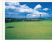
Place to enjoy Sports KADOGAWA SEASIDE PARK